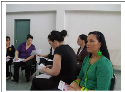
Participants at the recent Mental Health Course