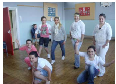
Above: Some of the teenagers at Hip Hop classes

The classes were high energy and the 11 girls who attended enjoyed it a lot.